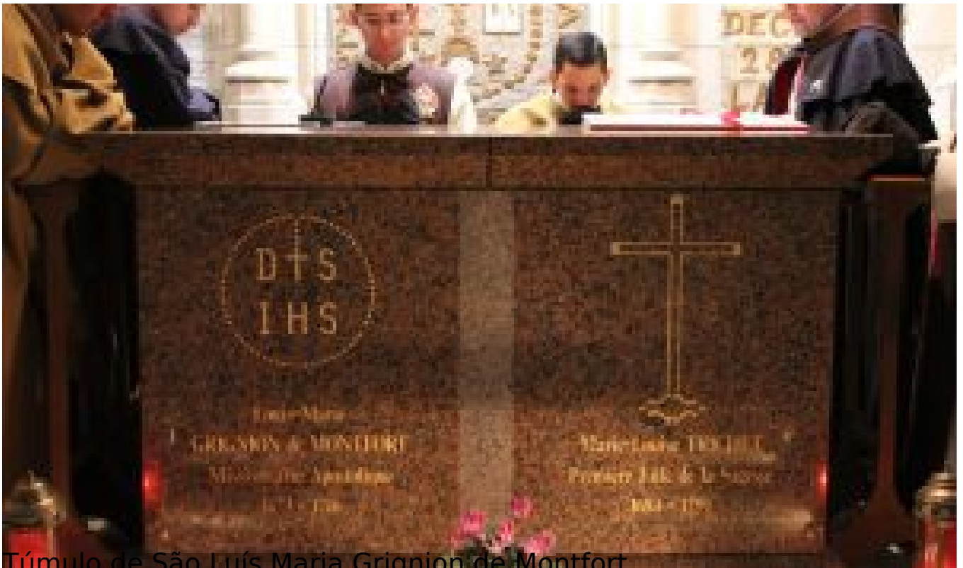
Túmulo de São Luís Maria Grignion de Montfort

fF Yj ]ghU'5fUi hcg`Xc`9j Ub[ Y`cž5Vf]`#&$%žb"%$ždd"" &{ ' ' ) ı