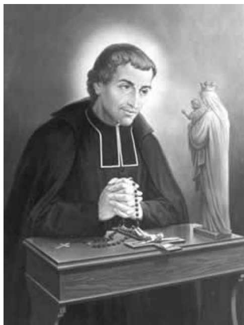
No colégio dos jesuítas de Rennes

GYa X•j ]XUžZc] bc Wt`fU, ~c XY gi Ua ~Y ei Y Wt`b\YWi c Ua cf U A Uf]U GUbhtgg]a UžY YghY`Ua cf`gY`hcfbci` Uj ]U`a cbhZcfh]UbU`dcf`Yi W`..bWjU"