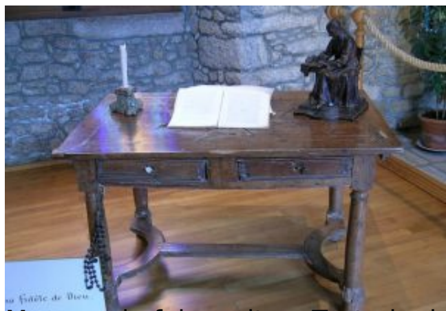
Mesa onde foi escrito o Tratado da Verdadeira Devoção à Santíssima Virgem

9bhfYhUbhcž fYWV]Xc Vča Yi hfYa U VcbXUXY dcf 7`Ya YbhY L =ž YghY c YbVčfU`ci U Včbh]bi Uf Yi YfWbXc gYi hfUVU`c a ]gg]cbzfc]c bU dfÆdf]U : fUb, U"